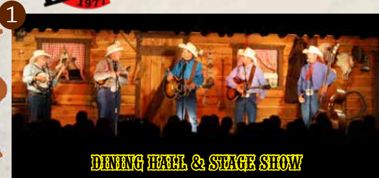
DINING HALL & STAGE SHOW