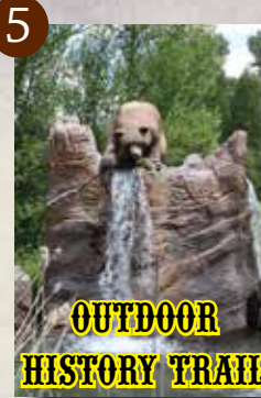
OUTDOOR HISTORY TRAIL