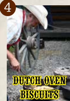
DUTCH OVEN BISCUITS