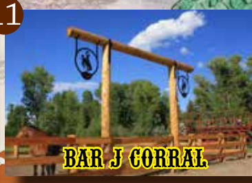
BAR J CORRAL